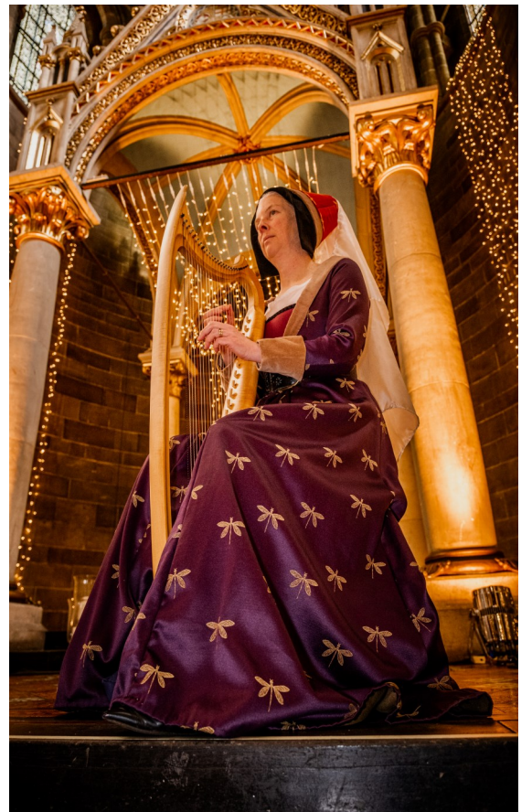
Photoshoot at Mansfield Traquair Centre on Sunday 13th March for Gaita Medieval Music-info @gaita.co.uk